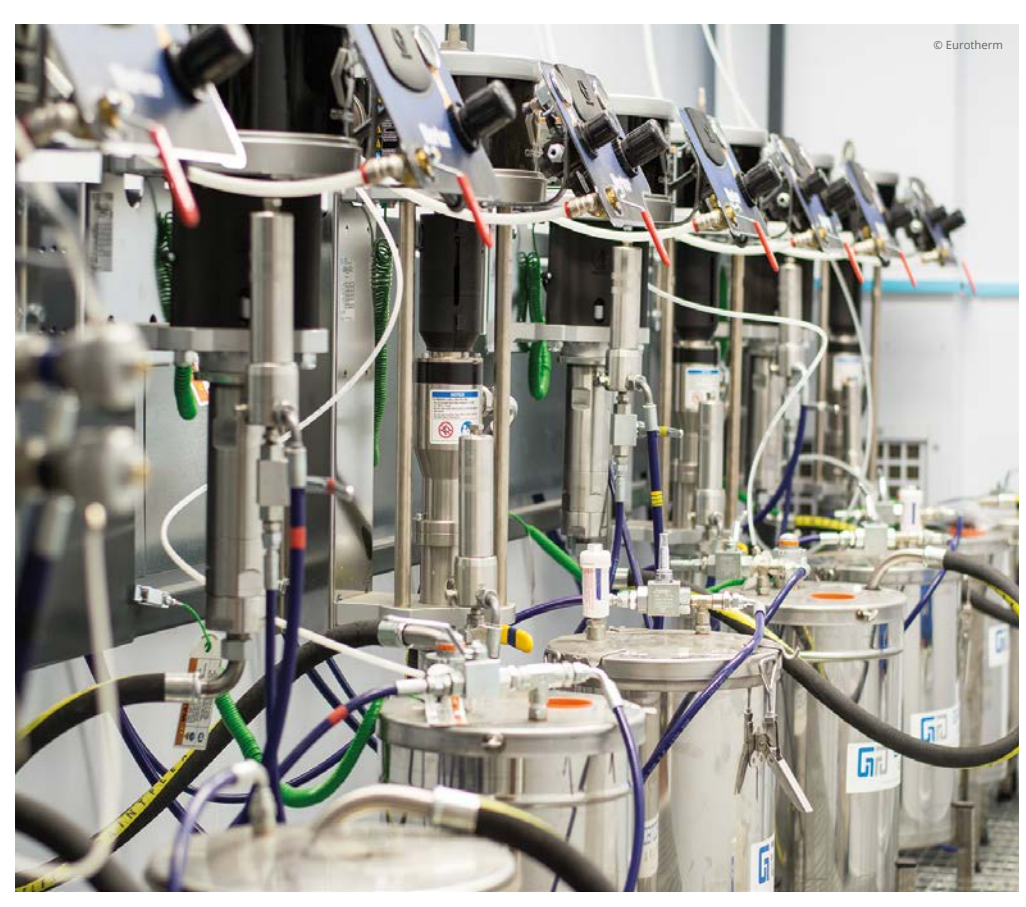
The paint kitchen.