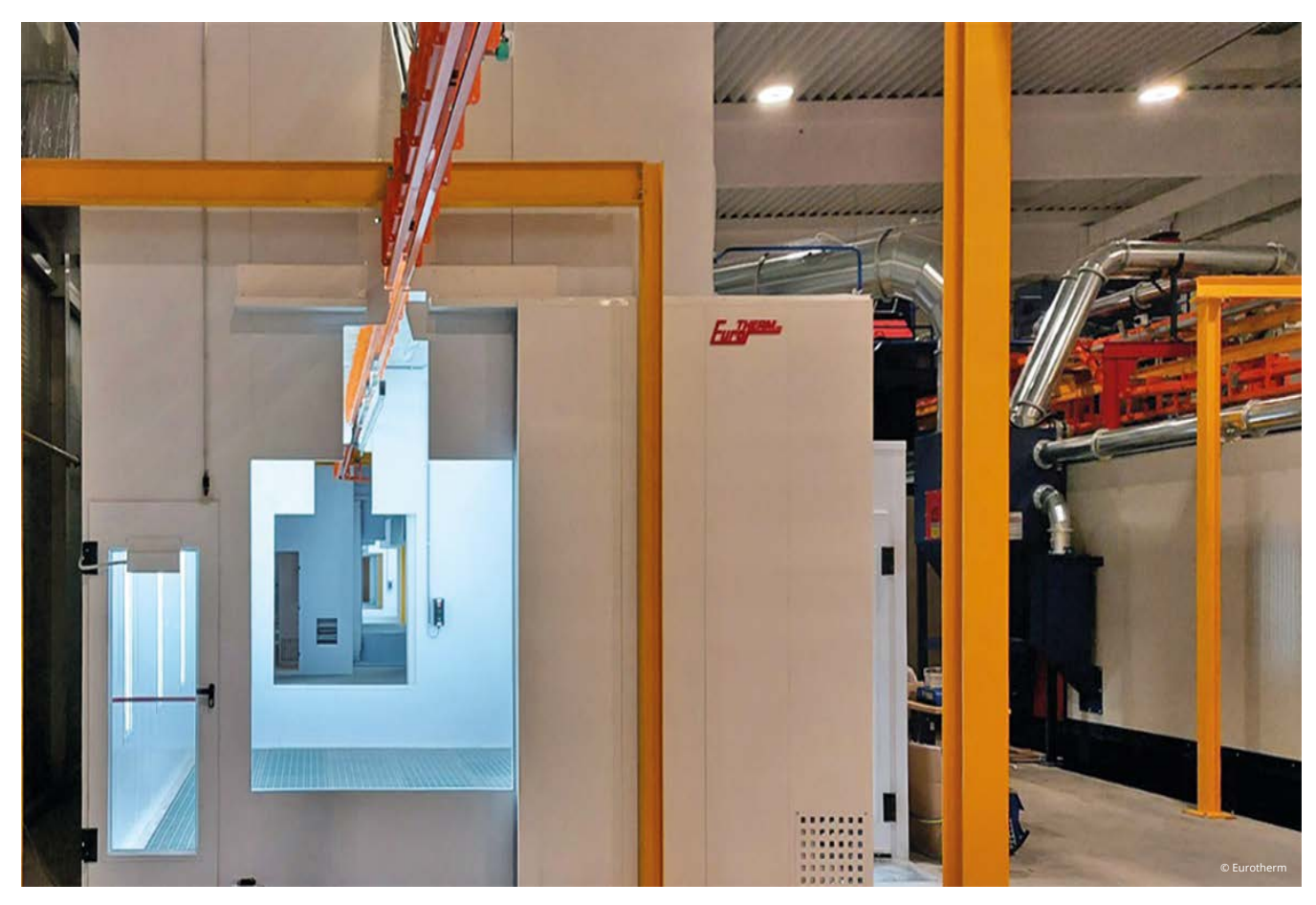
One of the two pressurized painting booth.

feed, suspended load GTU shotblaster provided by Italian company Cogeim, capable of treating them up to the SA 2.5 degree with a depth of approximately 60-80 microns.