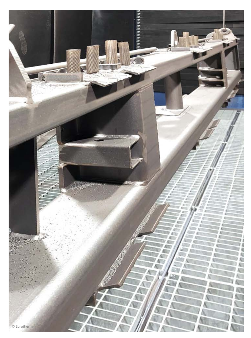
The blowing zone after the shot blasting.

When the time is right, the parts pass through a continuous through-