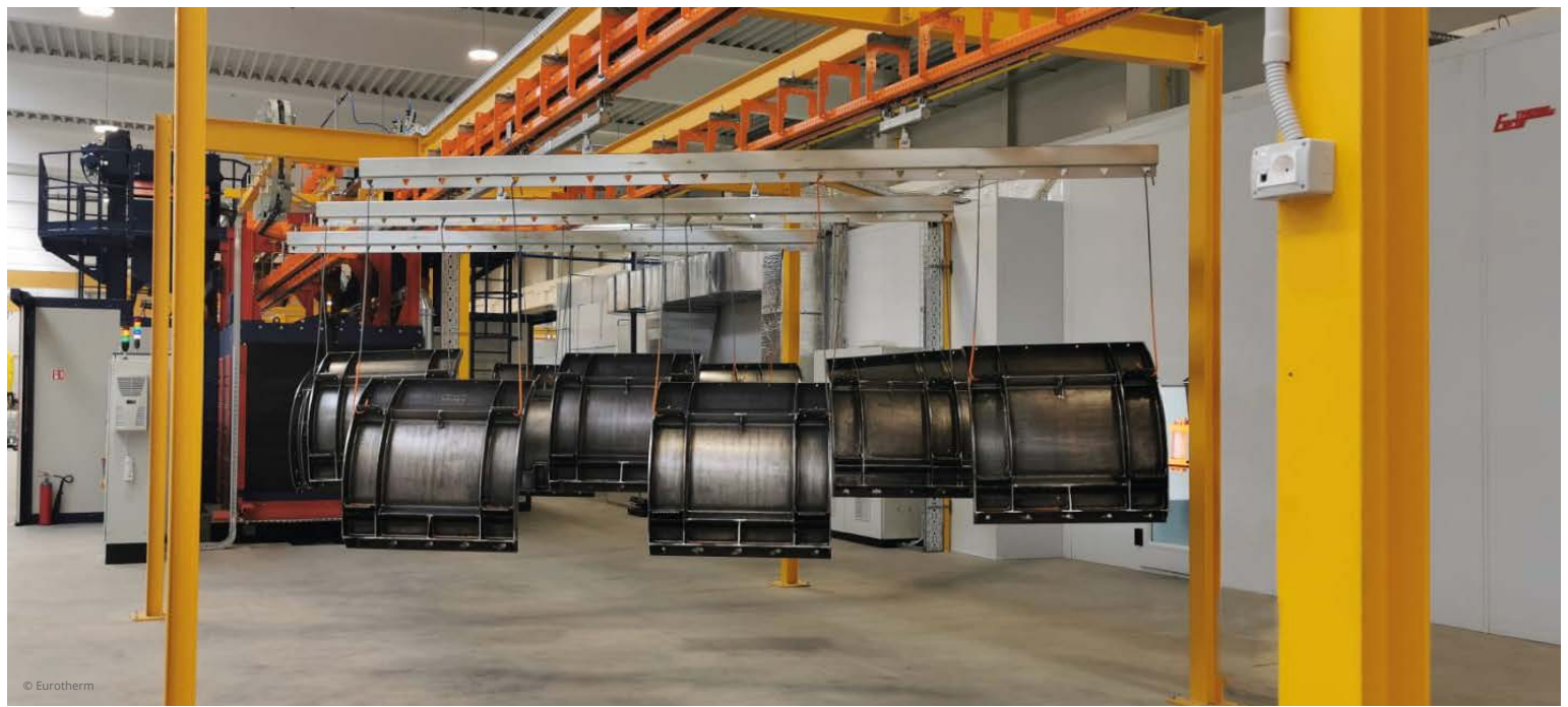
The automatic power&free overhead conveyor (on top) and the loading and unloading area.

"We've always taken great care of our surface treatment process, investing a lot in it: guaranteeing product quality is a must for our business and it's not only a matter of achieving a good aesthetic quality but first and foremost of ensuring the durability