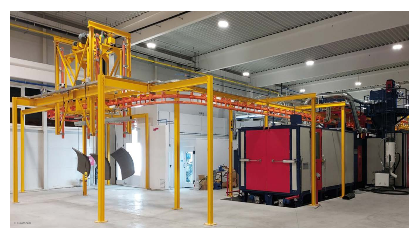
The liquid painting line with the automatic Power&Free overhead conveyor designed by Eurotherm.

"The production process at RASCO starts with raw materials, which undergo machining operations such as cutting, grinding, drilling, bending and welding. After the mechanical processes, the pieces are ready for the surface protection process, which consists of mainly two steps: chemical and mechanical pre-treatment and liquid painting. Once the pieces are painted, they are assembled and