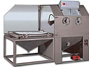
"TE" version with extractable rotary table