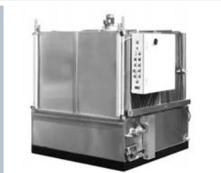
With watertight door closed