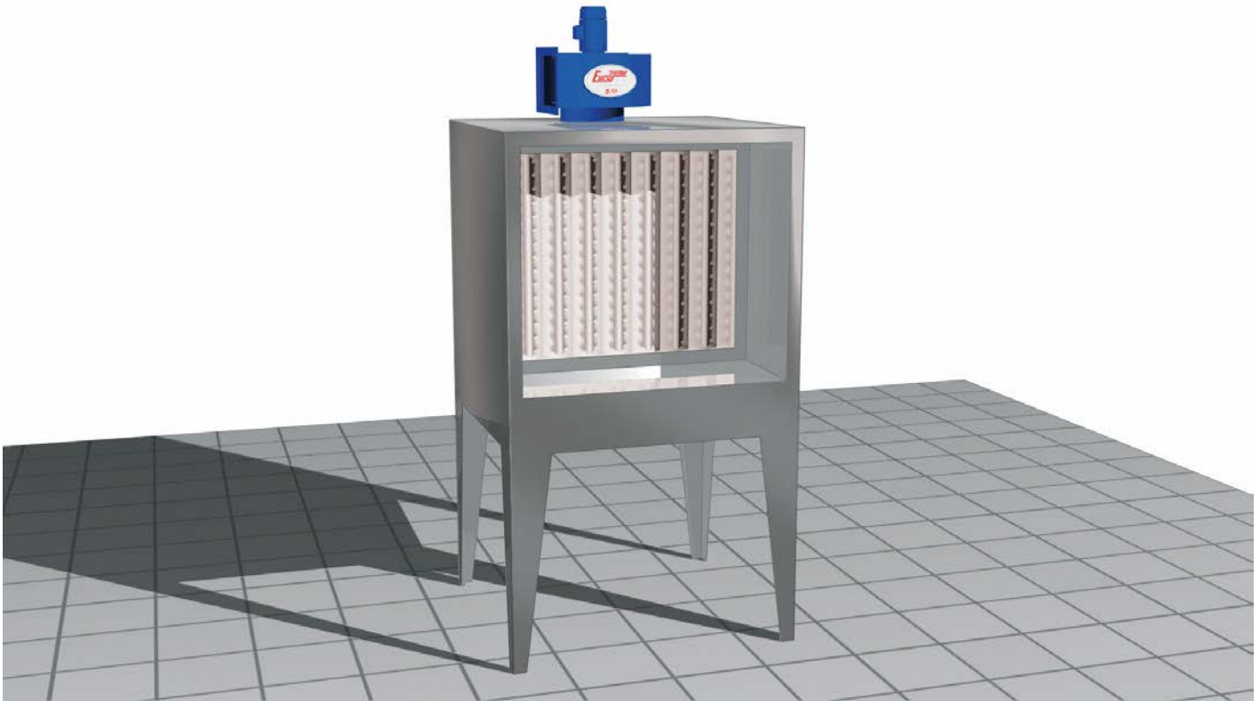
“Mini” range with simple filtration