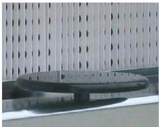
Rotating part carrier